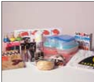
Cryovac® Specialty shrink films.