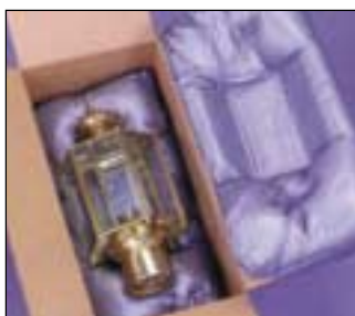
Instapak® Foam-in-place packaging.

Around the world Sealed Air manufacture and market a wide variety of packaging materials and systems to protect products from damage caused by shock, vibration and abrasion.