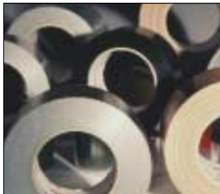
Danco Tapes® Adhesive Tapes.