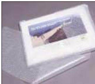
BubbleMask™ and Coldsea™ Adhesive & cohesive bubble cushioning.