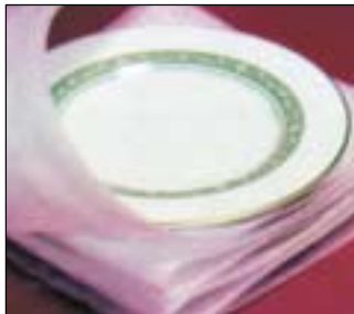
Cell-Aire® CFC and HCFC-free polyethylene foam.