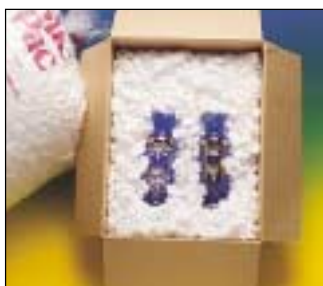
MicPac® CFC and HCFC free loose fill packaging.