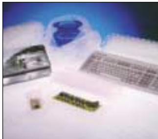
Polybubble™ Bubble cushioning.