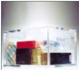
Fill-Air™ Inflatable packaging system.