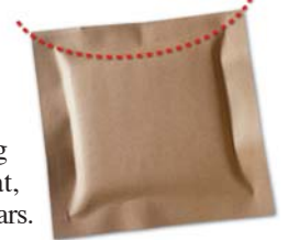
PriorityWrap® Rigid Board

PriorityWrap® Rigid Board utilizes our patented XRS Roller System creating a crescent seal that suspends the product, minimizing product shifting and providing additional corner protection. Ideal for flat, evenly shaped items, like books and calendars.