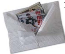
PriorityWrap® Bubble Laminate

PriorityWrap® Bubble Laminate provides strong, yet lightweight, protection. It is best for odd-shaped items or products in need of maximum cushioning and surface protection, like cosmetics, pharmaceuticals, CDs and DVDs.