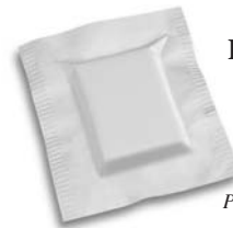
PriorityWrap® Film/Paper Laminate

PriorityWrap® Film/Paper Laminate provides a durable co-extruded film layer on the outside, and a tough kraft layer on the interior, making it perfect for lightweight products and soft goods.